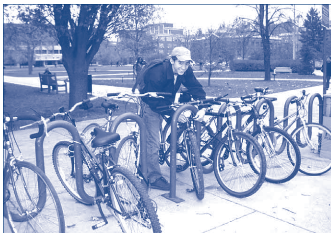
The results of this survey will assist the SMTC in developing recommendations for the overall Bicycle and Pedestrian Plan.