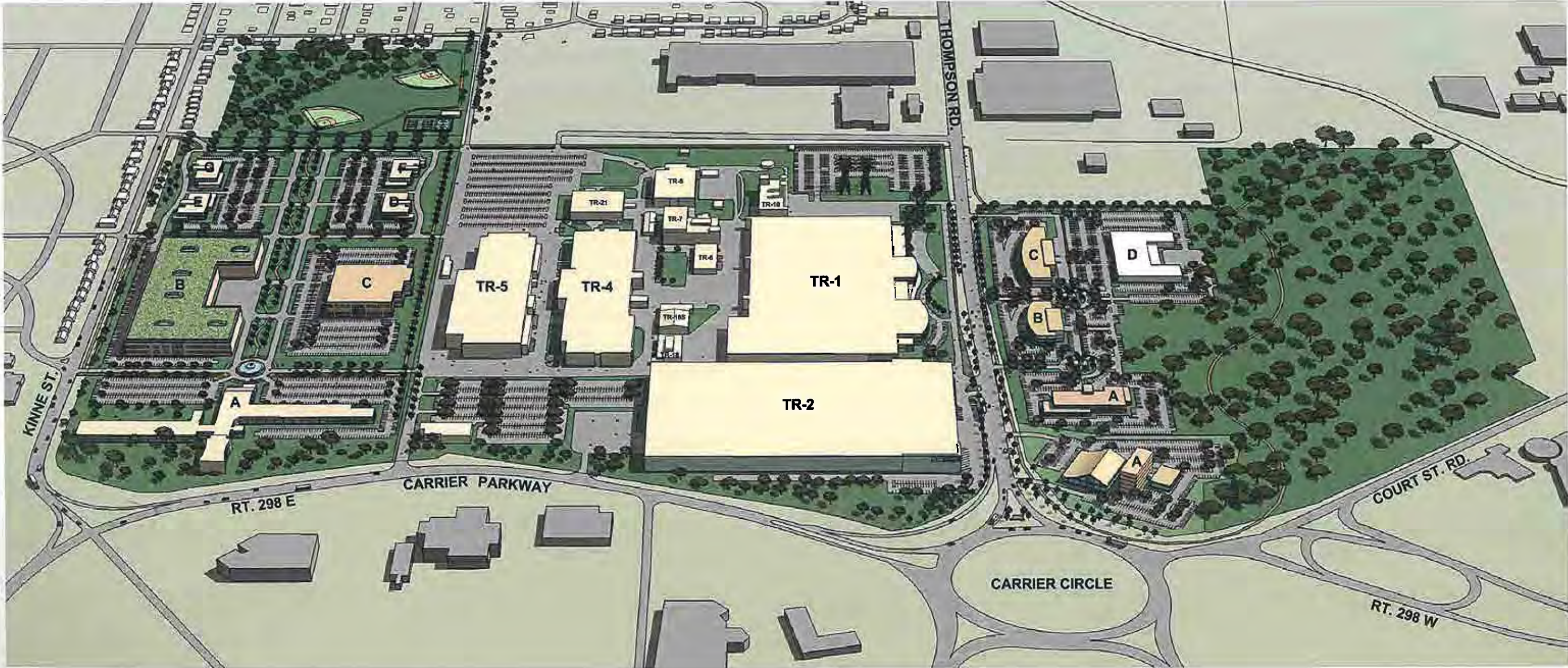
Aerial View of Preferred Master Plan